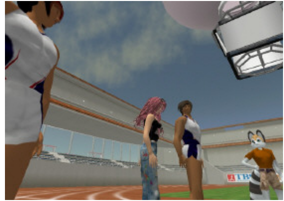
Scene of the 100m sprint starting line