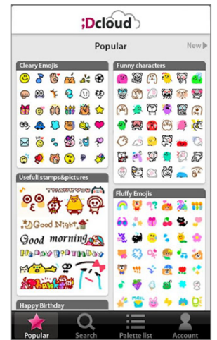
< ;Dcloud >